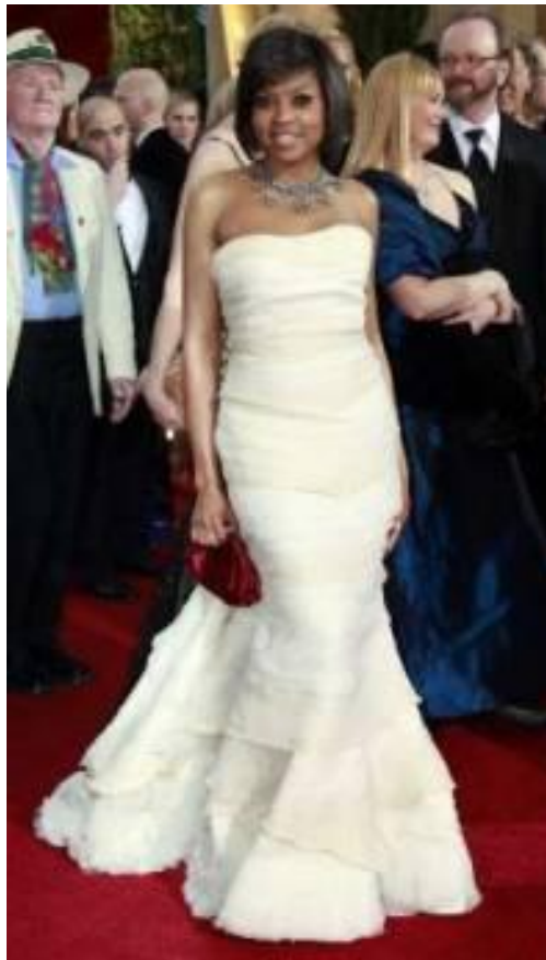
Taraji Henson [prison certainty]