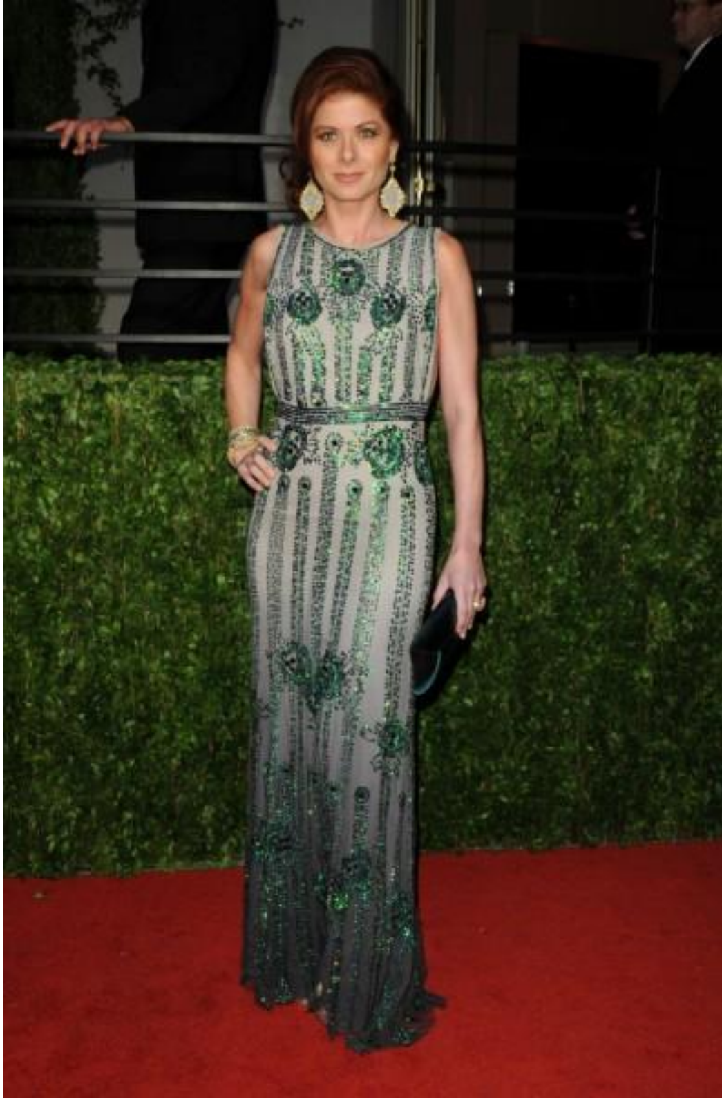
Debra Messing [prison certainty, quantum ]