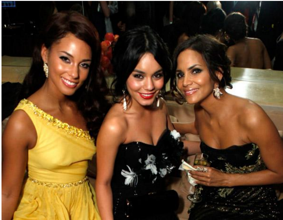
Alicia Keys, Vanessa Hudgens & Halley Berry [Presidential quantum & quantum ]