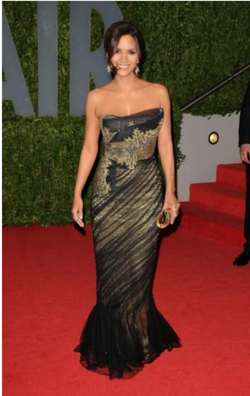
Halle Berry [prison certainty, quantum ]

The red carpet before and after the event was where Photographic Diplomacy was at its most obvious; with coalition stars parading their geopolitically inspired uber-fashion for the East-West Corridor audience.