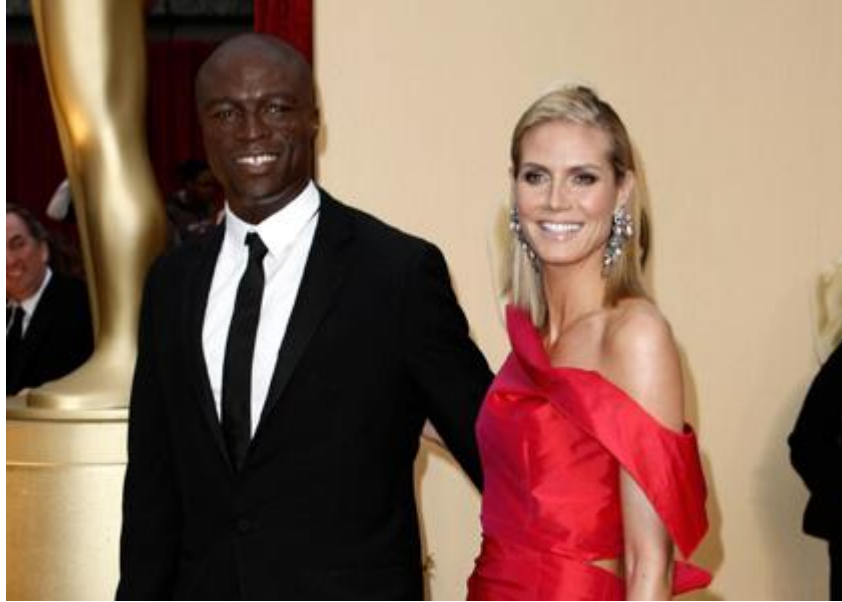
Heidi Klum & Seal [Canadian punishment certainty]