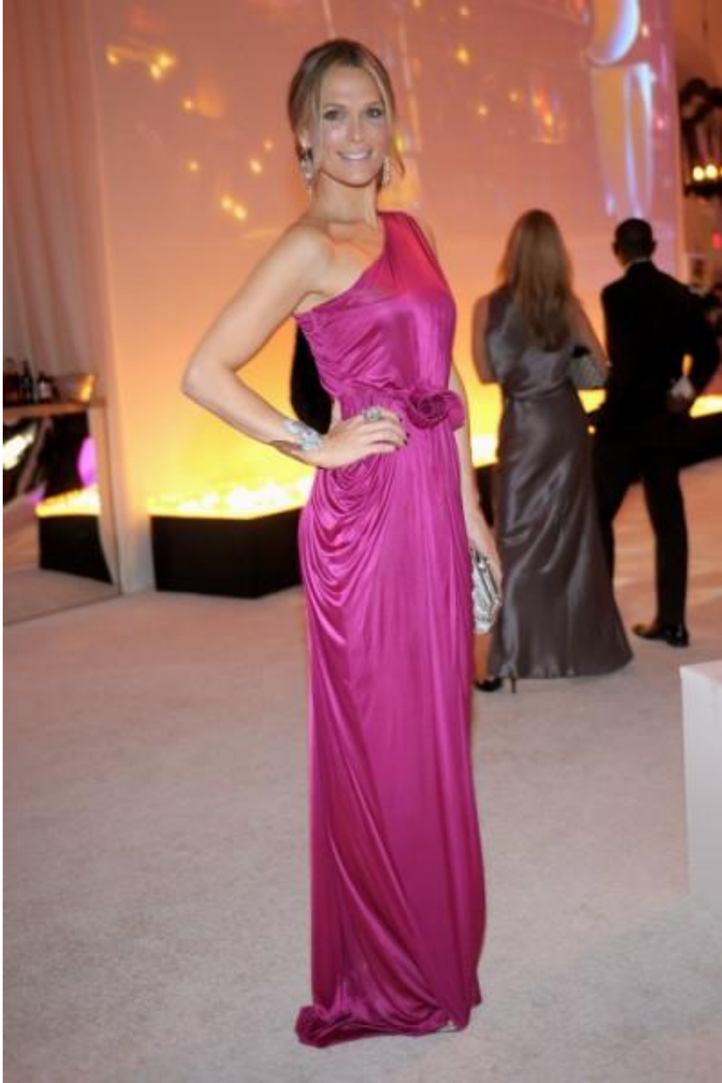
Molly Sims [condemnation]